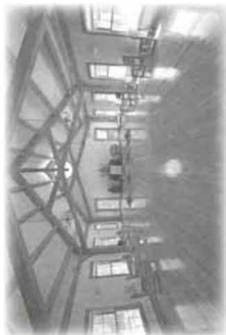
Dharma Hall at BCBS