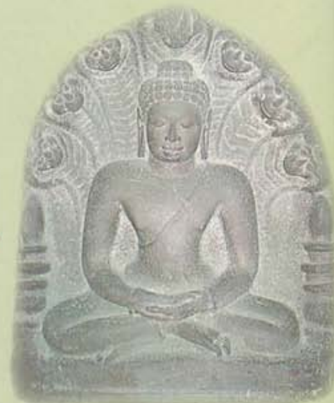
Dvaravati art – Buddha, protected by Naga. Thailand, 8 - 11 th century A.D

But getting free of the conceit that 'I am' —This is the greatest happiness of all.