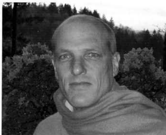
Careful listening has always been for me a mindful experience of impermanence.

One of the many interesting places this leads is towards understanding the constructed nature of our issues with such things as race, ethnicity, gender and power. With interpersonal meditation, the nature of our constructs of self and other become very clear, just as in personal meditation our self-constructs become clear. One sees