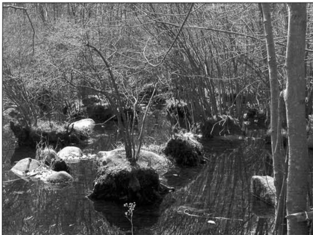
New England Zen garden (marsh on a road near the study center)

state that is actually very natural to us. We just haven't trusted it enough to simply be there. We feel assaulted by the world and feel the need to construct these various self representations, and to some extent of course that's true. But then we buy into and believe we really are these selves we have constructed in relationship to our circumstances as we grow up in this world. We need a kind of trust in something greater than anything we have yet imagined, because this isn't going to be something we can or necessarily even want to imagine. This is going to be something we enter into through the direct experience of our practice, without knowing ahead of time how it is going to be.